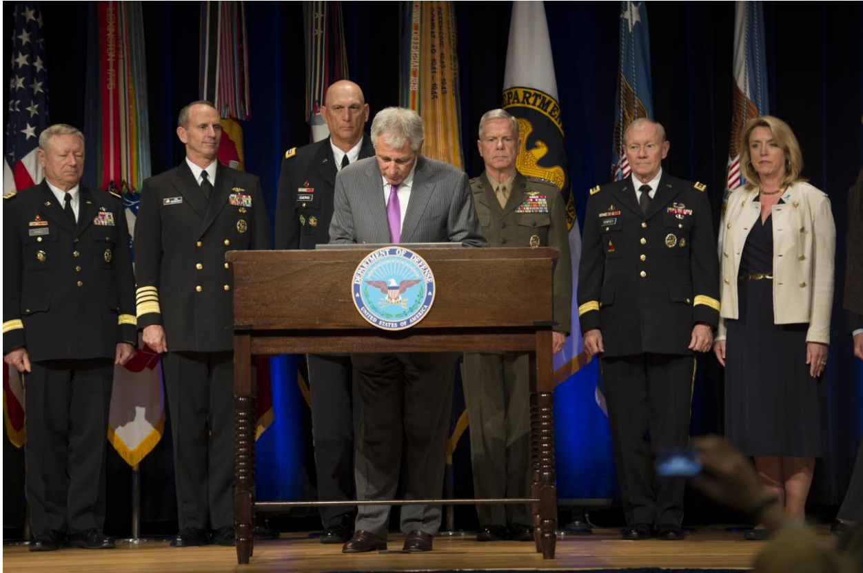
Defense Secretary Chuck Hagel signs the Human Goals Charter during a ceremony at the Pentagon, April 28, 2014. "I'm proud that the language of the charter has been updated to reflect the contributions of gay and lesbian military personnel who now serve openly and proudly across America's armed forces," Hagel said.