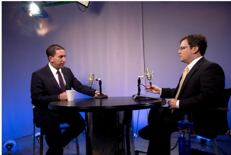
Journalist Glenn Greenwald, who along with other journalists at The Guardian and the Washington Post was recently awarded the Pulitzer Prize for their reporting on the National Security Agency, visited the Cato Institute to record an extended podcast and